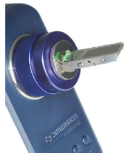
LC Transceiver Inspection