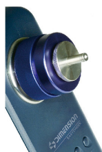
TOSA & ROSA Inspection