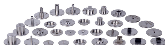
Series of Adaptors