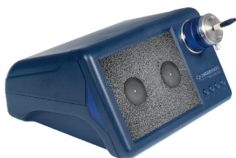
MPO Connector Inspection

Easycheck has an extensive range of adaptors and can check all kinds of fiber connectors ( MPO/MTP, MT-RJ connector ), Optic transceiver Module ( 40G -100G MPO Module, SFP, XFP, QSFP ) , TOSA/ROSA components and so on.