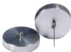
Embedded Ceramic Sleeves

Easycheck can check connectors, modules(TOSA、 ROSA), and the adjustable version can check multi-fiber connectors.